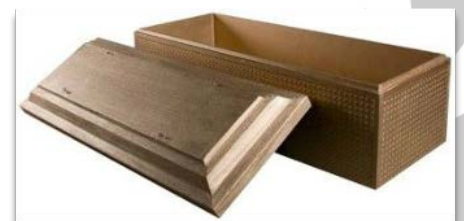
Guardian Non-Sealing Vault