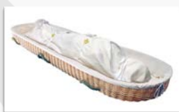
*Willow Carrier and Shroud