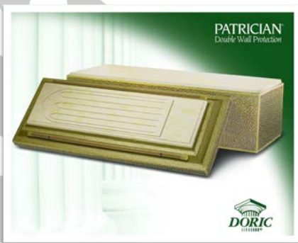
Patrician Sealing Vault