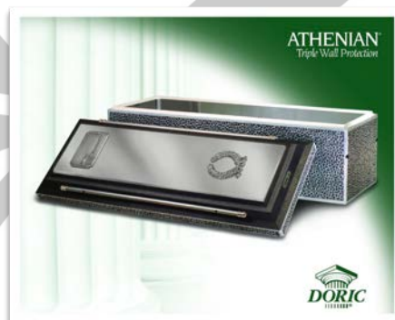
Athenian Sealing Vault